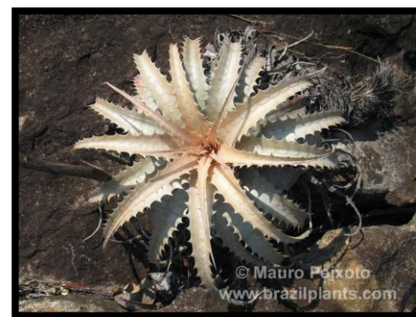
Dyckia "Inhai" from Brazil Plants

I recently got some Dyckia seeds (and some tilly seeds, but that's for later, too) from Brazil, and guess what? They work! Dyckia seeds are very easy to start and keep going. At Brazilplants, owner Mauro Peixoto has a wide selection of native species seeds, including many broms. The plants frequently have a locality used in place of a formal name. I have seeds started of several different species, including Dyckia "Inhai" (see photos). Wow!