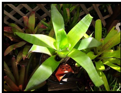
This lovely Alcantarea extensa was started from seed three years ago.