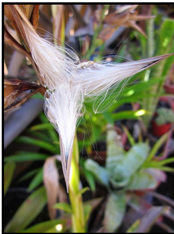
Tillandsia viridiflora variegated form presents its freshly-prepared seed in a most beautiful “trident” configuration.