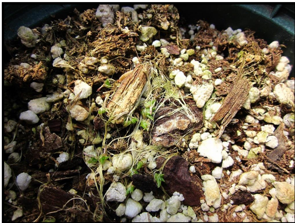
These Tillandsia carlsoniae seedlings (from Europe, no less) were begun last year on water-wick cloth and then transferred to this pot, where they mostly “float” above the actual soil on mats of their “parachute string” remnants or bits of wood. I cross my fingers daily, (and spray frequently to keep them moist, sometimes with a fungicide) and these critters have somehow survived several seasons . . . so far.