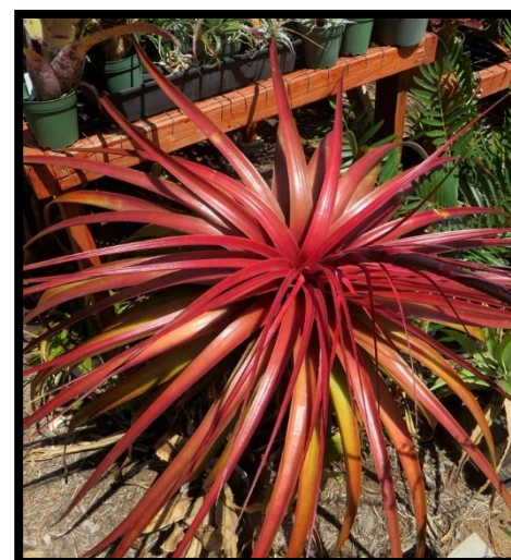
xEnchotia 'Ruby' - detail of the plant below