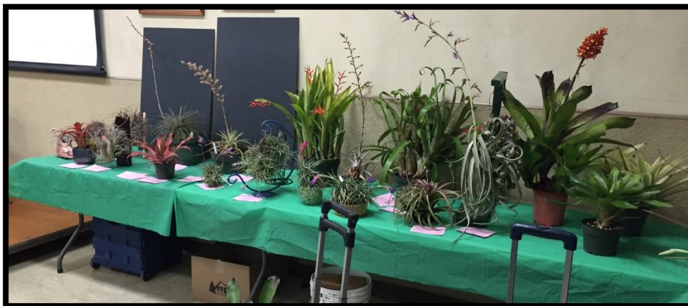
Show and Tell table

Featured select collectibles from Tropiflora, starring almost impossible bigenerics: xEnchotia 'Ruby' (see Andy Siekenen's mature flowering plant on page 6, awesome). xNeophytum "Andromeda", xOrthoglaziovia "Rosita". It was the day of the Xs!