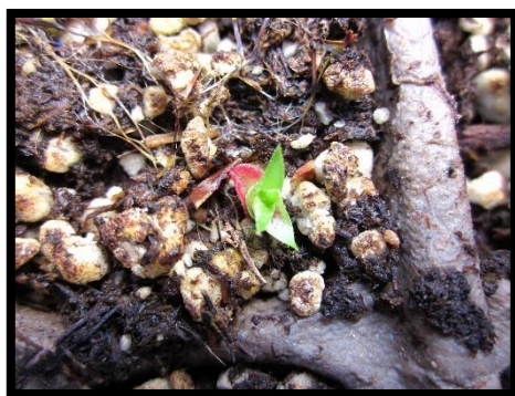
Dyckia "Inhai" seedlings (top), seedling detail (bottom)